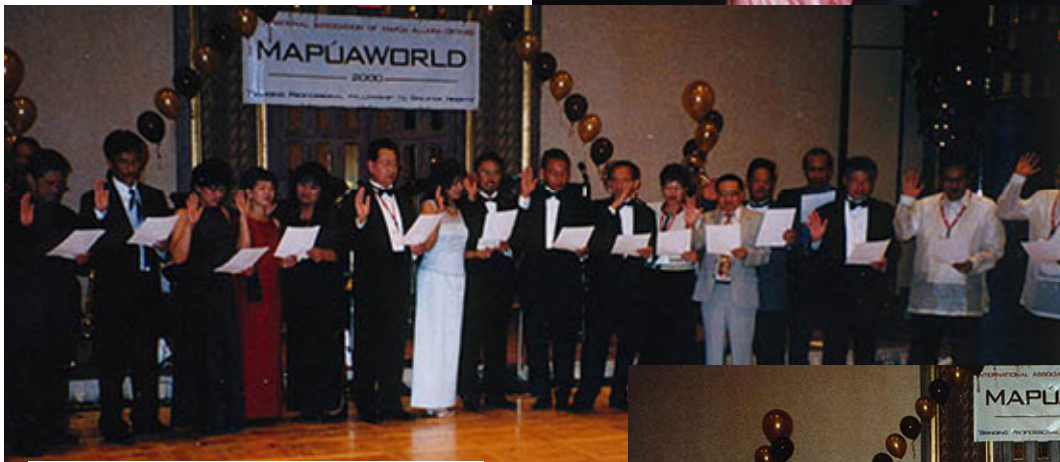
IAMAO Executive Induction