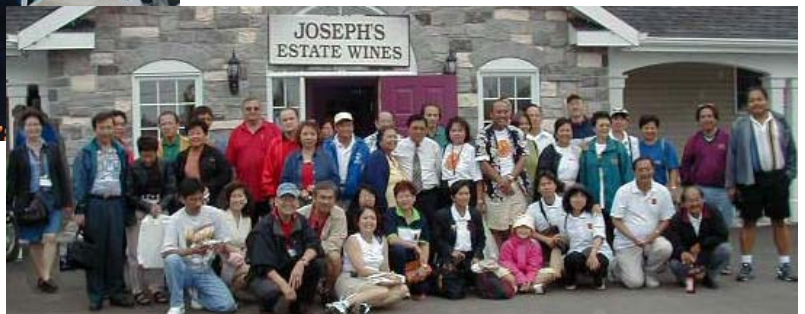
One more shot!