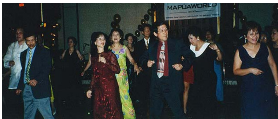
Alumni and guests whoop it up at the Millennium Grand Reunion.