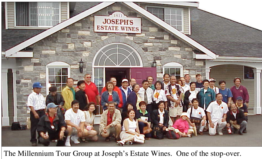
The Millennium Tour Group at Joseph's Estate Wines. One of the stop-over.

Two years from now, Mapúans will again convene to celebrate MapúaWorld 2002 to be hosted by the Southern California Mapúa Alumni Association. §